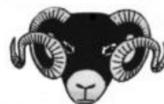
Glaisdale Primary School

Glaisdale school currently has 26 pupils on roll across two classes: Explorers (EYFS/KS1) and Adventurers (KS2). We have a relatively new staff team who have worked hard in recent months to develop our curriculum, sports offer, school council and EYFS provision.