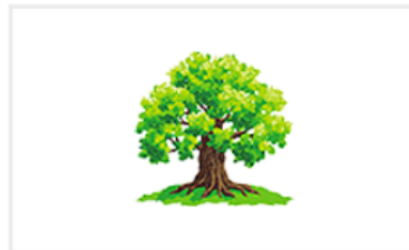
CHELSEFIELD PRIMARY SCHOOL