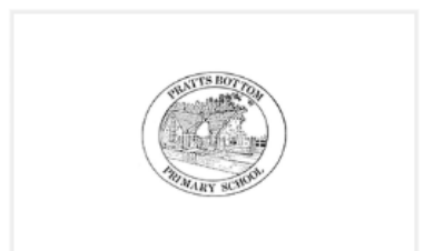
PRATTS BOTTOM PRIMARY SCHOOL