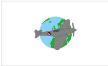
BIGGIN HILL PRIMARY SCHOOL