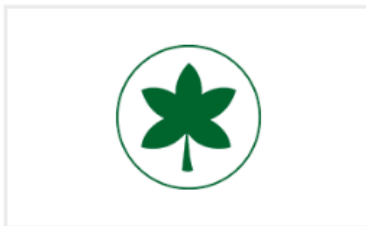
DARRICK WOOD JUNIOR SCHOOL