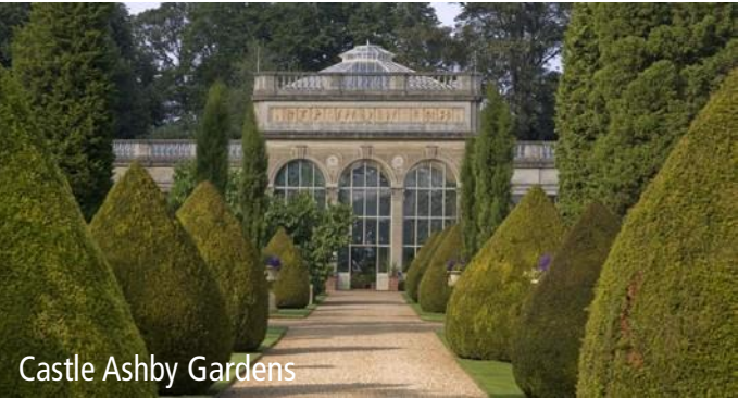
Castle Ashby Gardens