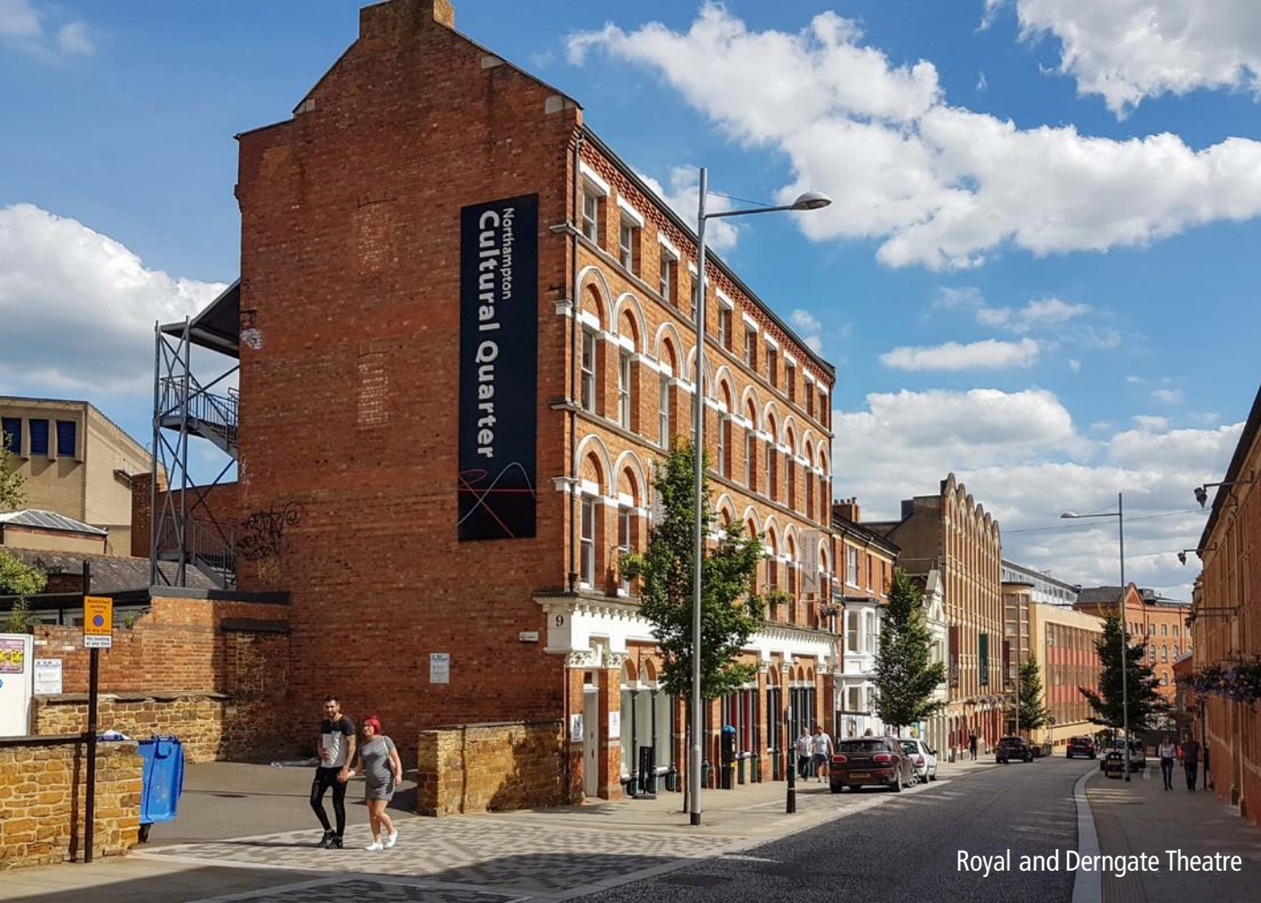
Royal and Derngate Theatre