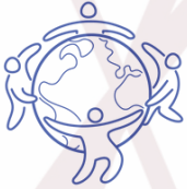
CHILDERIC PRIMARY SCHOOL