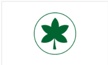
DARRICK WOOD JUNIOR SCHOOL