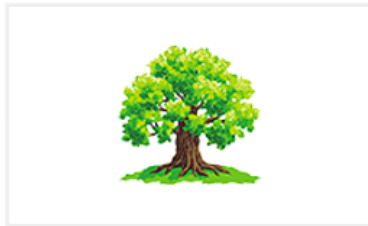
CHELSEFIELD PRIMARY SCHOOL