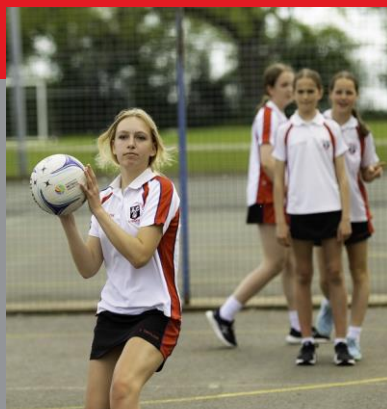
Annual Celebration of Sport Award