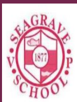
Seagrave Village Primary School