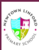
Newtown Linford Primary School