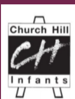
Church Hill Infant School