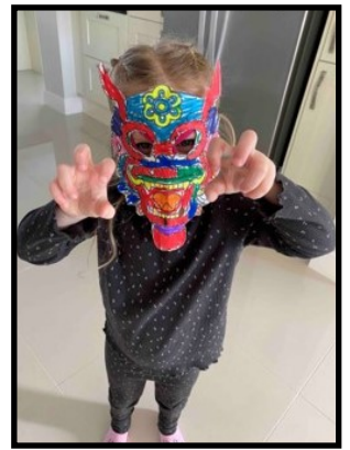
Long Sutton County Primary School Spring Term 2021