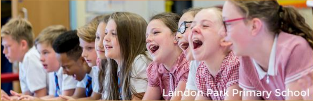
Laindon Park Primary School