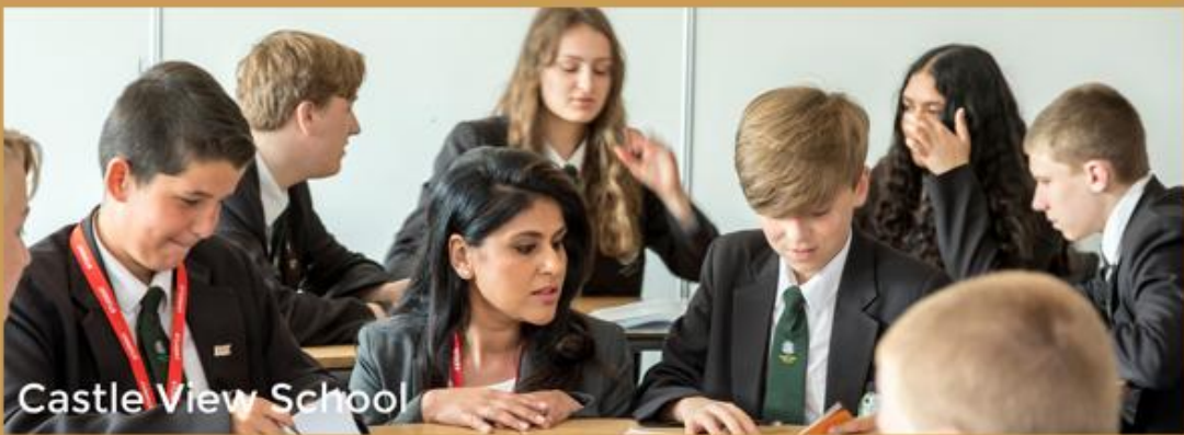
Castle View School