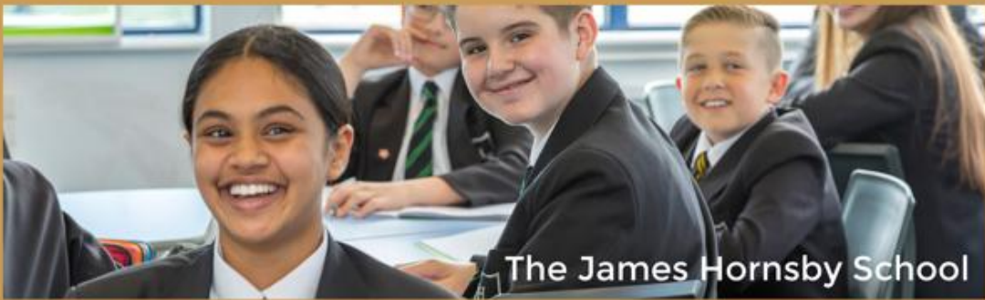
The James Hornsby School