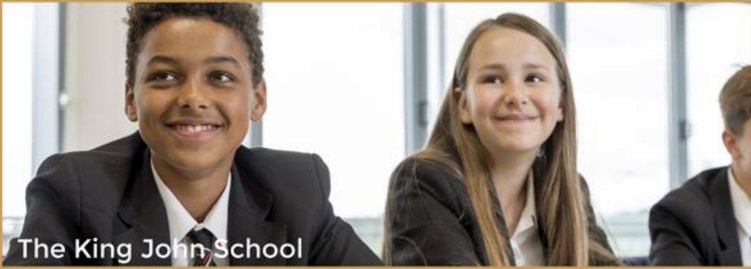
The King John School