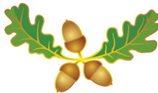
Oaklands Infant School