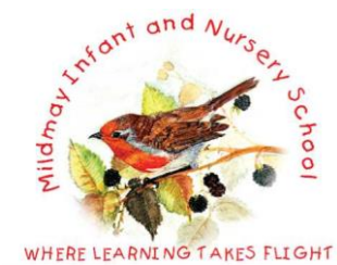
Mildmay Infant and Nursery School