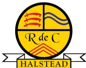
Richard de Clare Community Academy