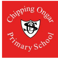
Chipping Ongar Primary School