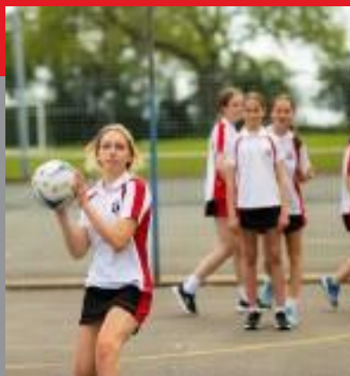
Annual Celebration of Sport Award