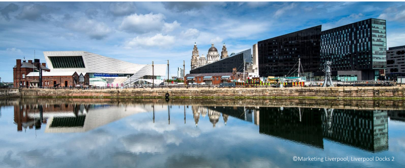
Liverpool Docks 2

Liverpool is a city with unique attractions, exciting events, world class sport offerings, unrivalled musical heritage and a famously warm welcome!