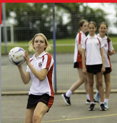
Annual Celebration of Sport Award