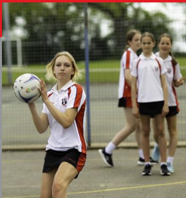
Annual Celebration of Sport Award