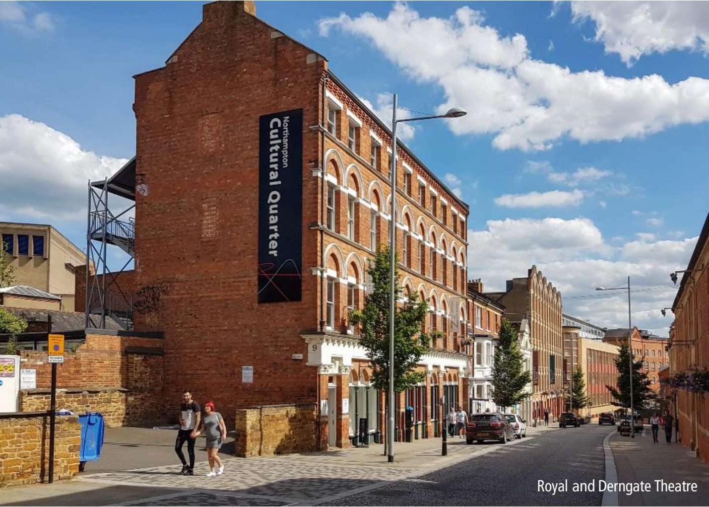
Royal and Derngate Theatre