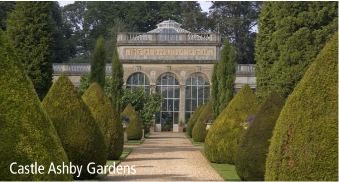
Castle Ashby Gardens