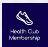
Health Club Membership

An offer to purchase an electric car by spreading the cost and also making savings on your Tax and National Insurance contributions via our salary sacrifice schemes.