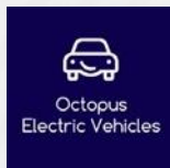
Octopus Electric Vehicles

An offer to purchase a cost effective way to get new cycling equipment and bicycles by spreading the cost and also making savings on your Tax and National Insurance contributions via our salary sacrifice schemes.