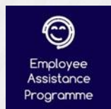
Employee Assistance Programme

Video or phone consultation with a GP at a time that suits you.