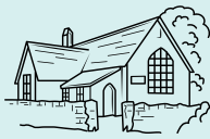
All Saints CofE Primary School