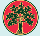
Saltford CofE Primary School