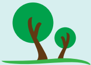
Chestnut Park Primary School