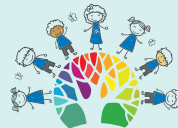
Chandag Infant School