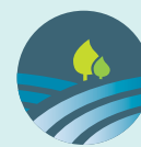
Two Rivers CofE Primary School