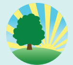
Wansdyke Primary School