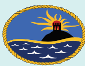
St Nicholas' Chantry CofE Primary School