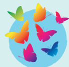
The Meadows Primary School