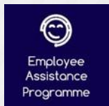
Employee Assistance Programme

Video or phone consultation with a GP at a time that suits you.