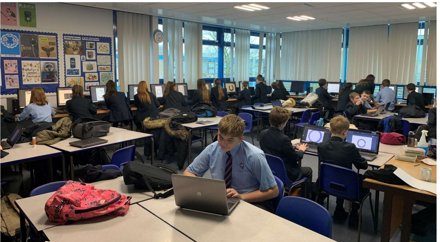
A13 Graphics Studio