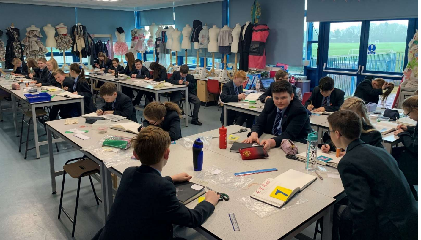
A11 Textiles Studio