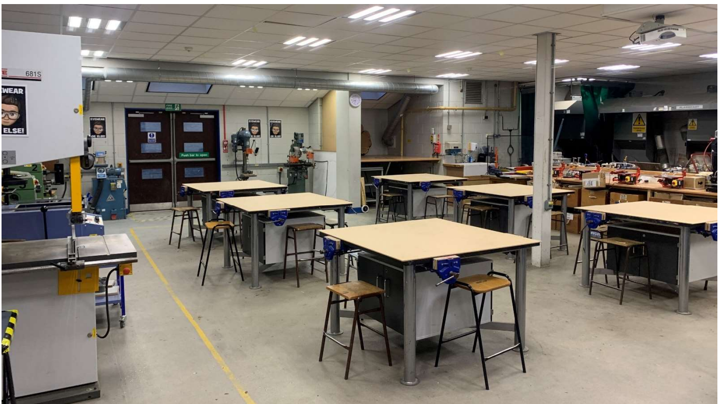
A3 Product Design and Engineering Workshop