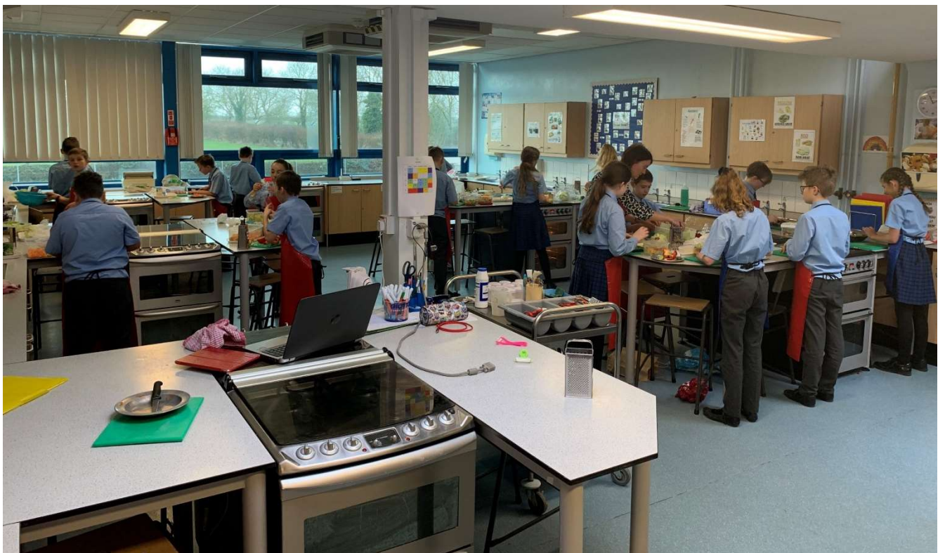
A10 Food and Nutrition