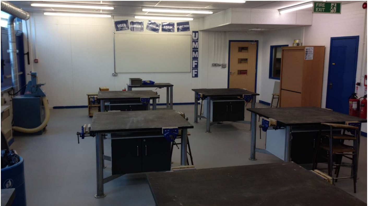
A2 Product Design Workshop