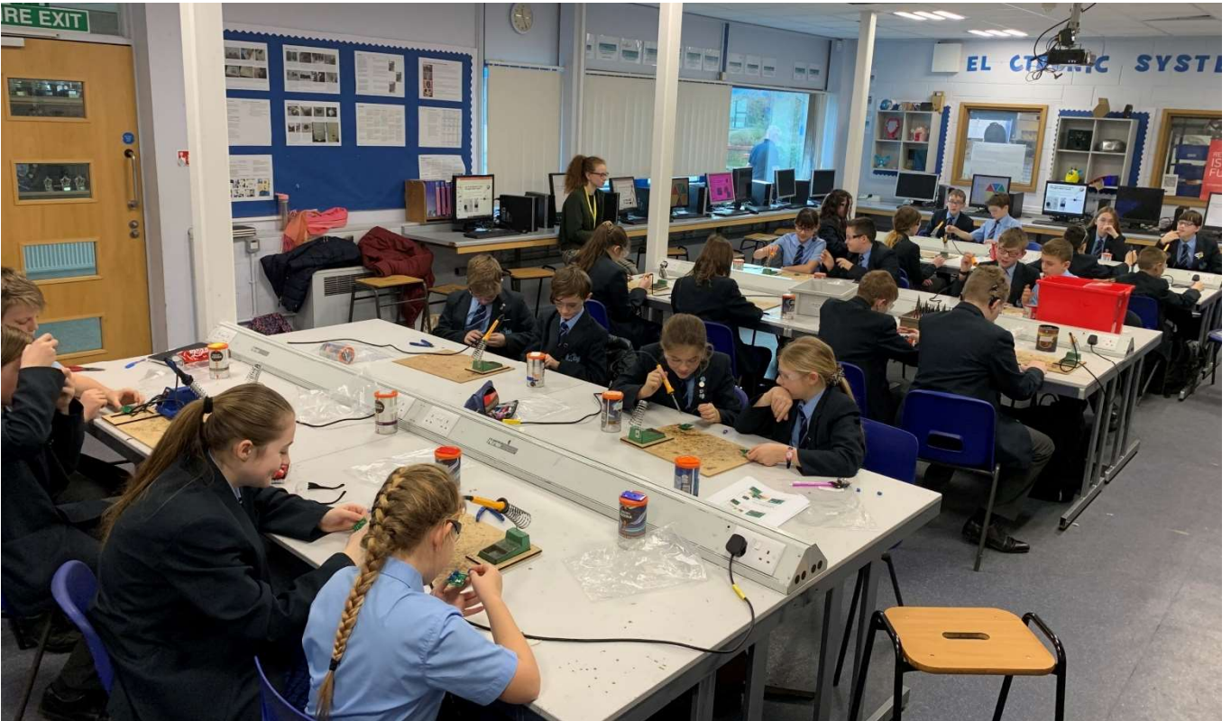
A4 Design Engineering Lab