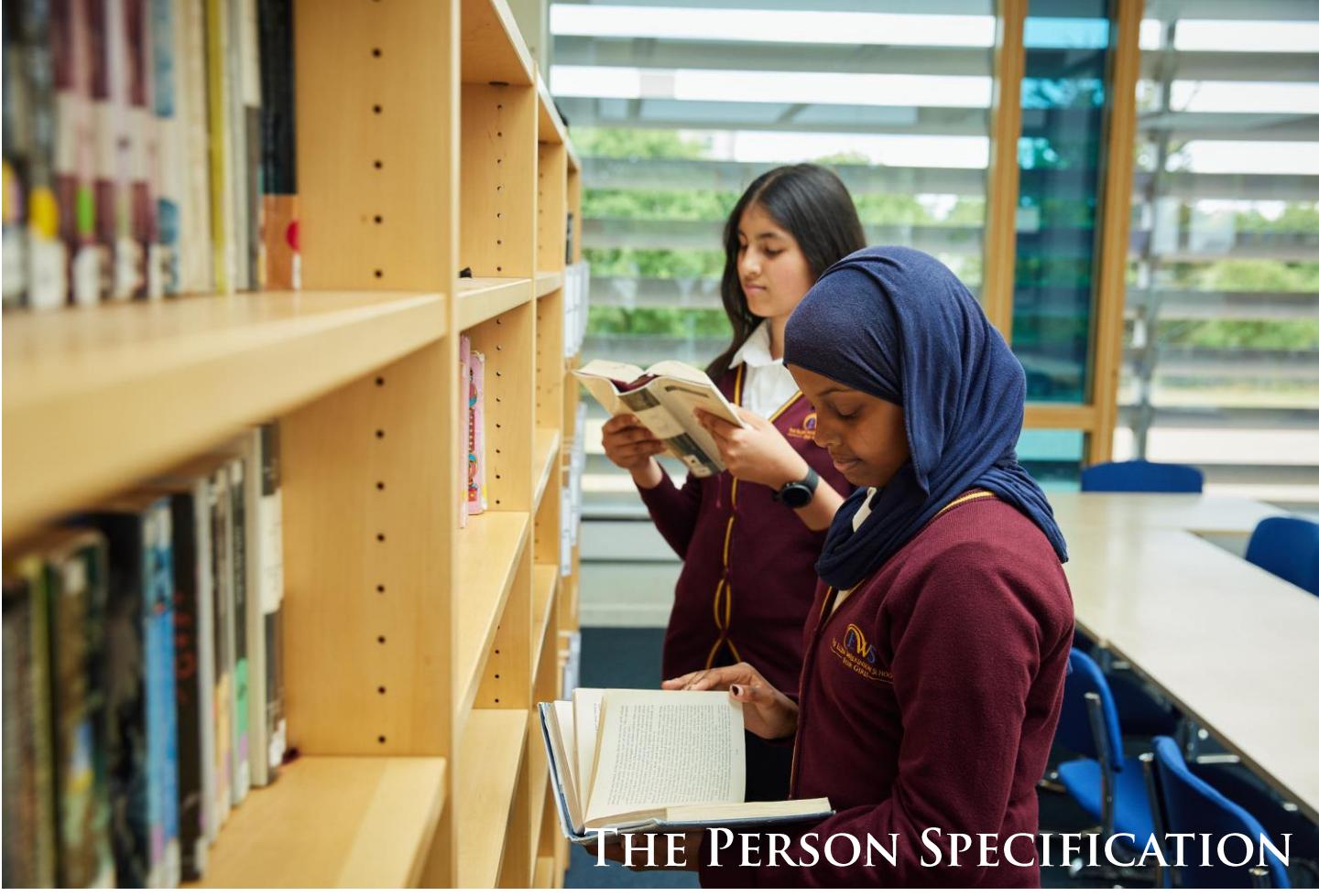
Please make sure when completing your application form that you give clear examples of how you meet the criteria.