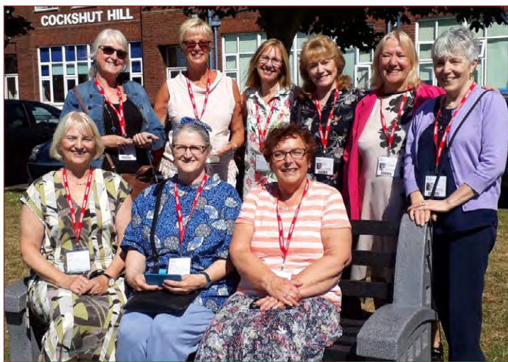
Cockshut Hill Ladies of 1968 - Reunion