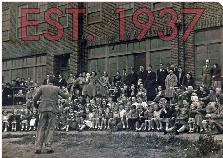
Celebrating VE day May 1945

In 2016 Cockshut Hill became part of the Summit Learning Trust and is now Cockshut Hill School.