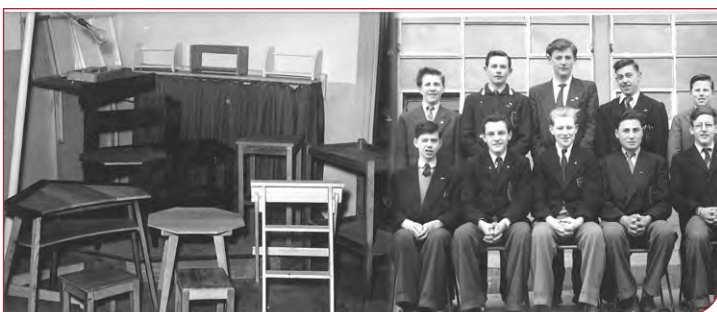
Looking back to the 1940s