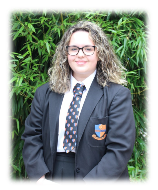
Amelie House Deputy Head Student

You should become a teacher at this school to help more people create memories here that are founded upon you. Ones that in ten or twenty-years' time you will be the teacher who they remember clear as day. And the lessons that you shared.