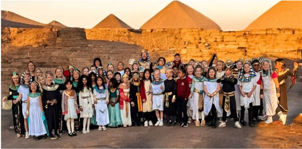
Yr3 Egyptian Day

Our curriculum is enriched with opportunities that extend beyond the classroom, allowing children to explore new passions, develop key life skills, and connect with the world around them. We achieve this through: