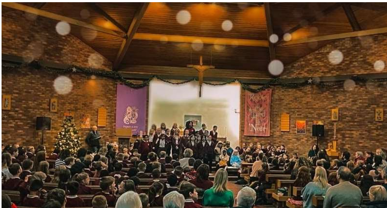
Annual Carol Service 2024