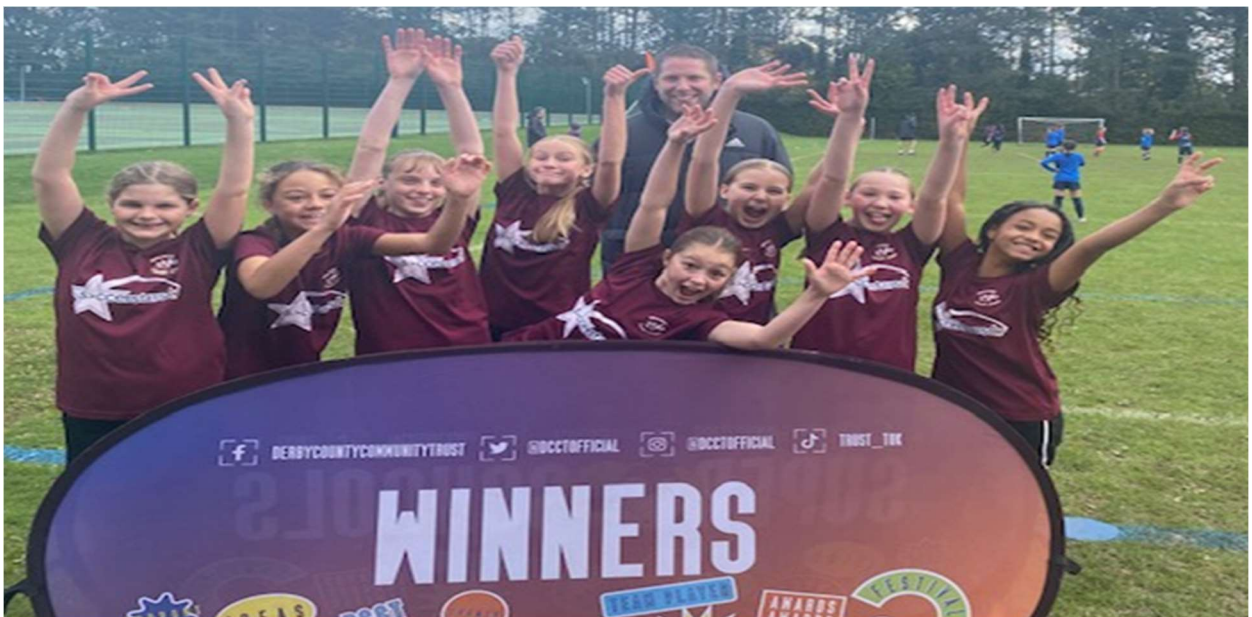
Yr6 Winners in the 2024 Football tournament