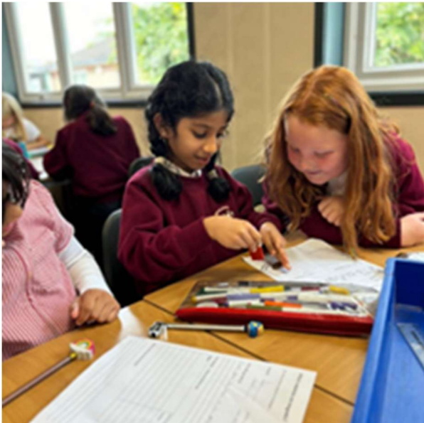
Year 3 Science lesson