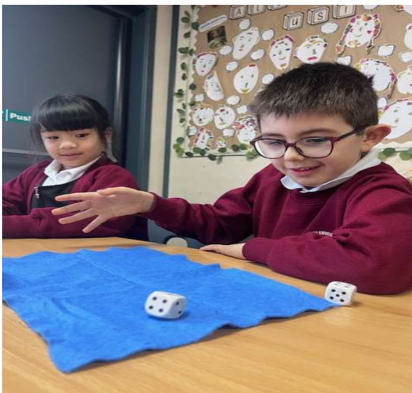
Yr2 Marvellous Mathematicians