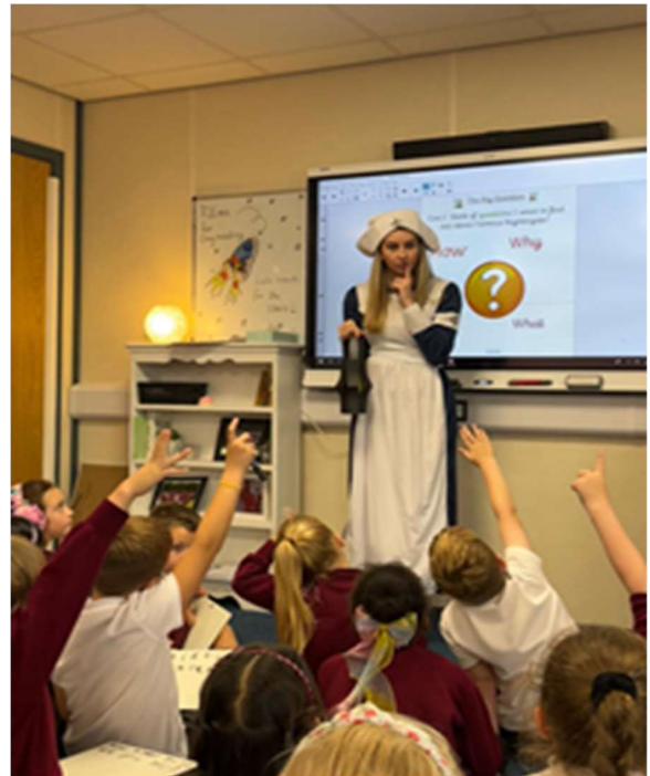
Yr2 Florence Nightingale