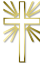
Holy Family Catholic Primary School