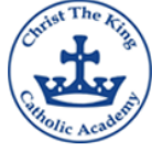
Christ the King Catholic Academy