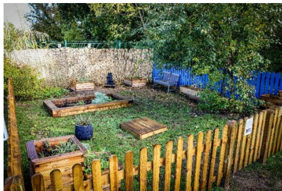
One of our prayer gardens at Bishop Chavassee

We aim to inspire all in our school community to fulfil their potential through our high expectations and a broad, creative and inspirational curriculum; rich in opportunity to develop culture capital, have fun and partake in adventures. Everyone will develop an everlasting love of learning.