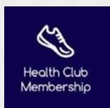
Health Club Membership

An offer to purchase an electric car by spreading the cost and also making savings on your Tax and National Insurance contributions via our salary sacrifice schemes.