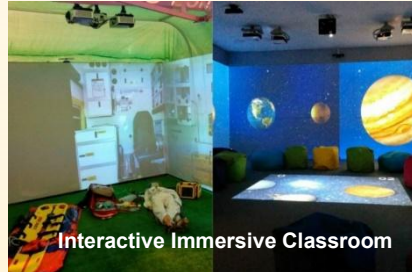
Interactive Immersive Classroom