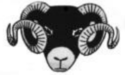
Glaisdale Primary School

Glaisdale school currently has 26 pupils on roll across two classes: Explorers (EYFS/KS1) and Adventurers (KS2). We have a relatively new staff team who have worked hard in recent months to develop our curriculum, sports offer, school council and EYFS provision.