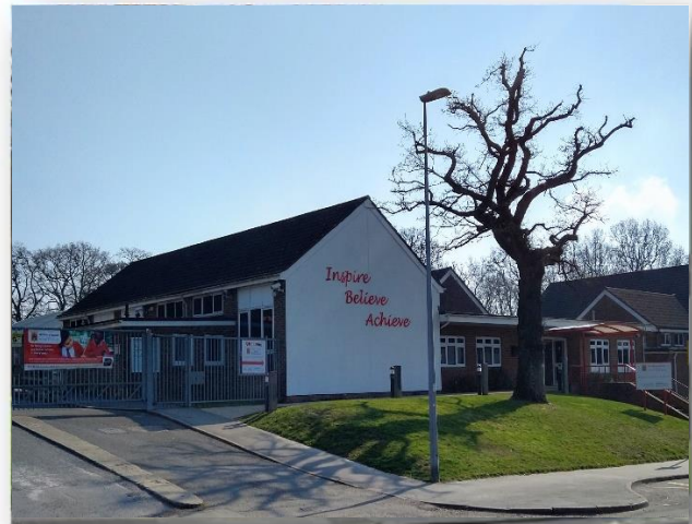
Today: Sir Henry Fermor Church of England Primary School on Crowborough Hill