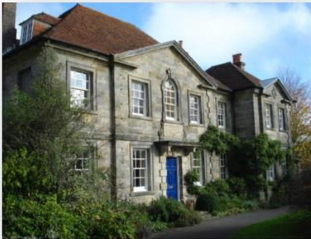
The original school: now used as All Saints' Church Vicarage at Chapel Green