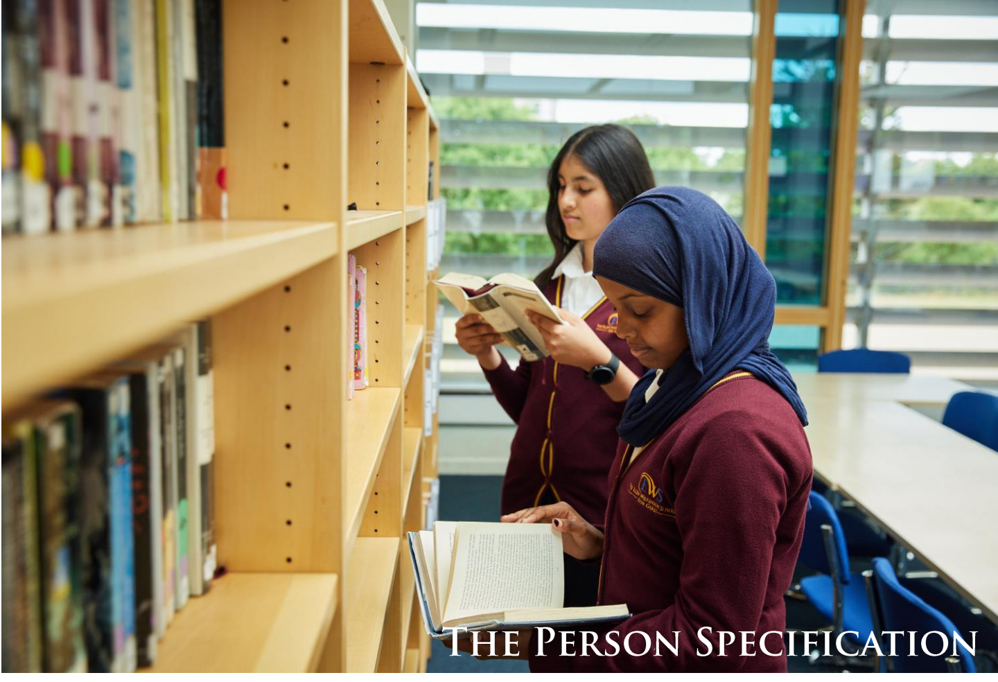
Please make sure, when completing your application form, that you give clear examples of how you meet the criteria.