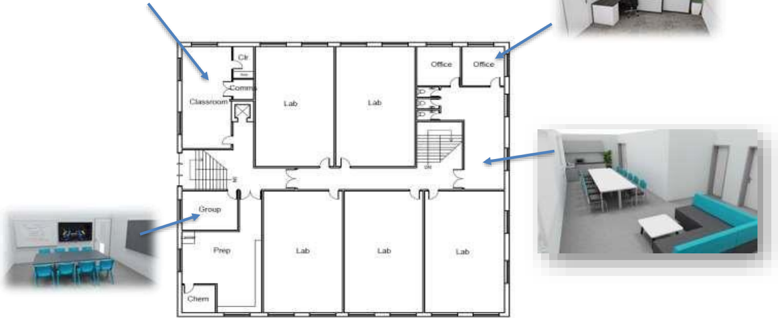
Proposed Ground Floor Layout Plan - Science