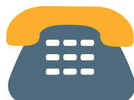
Free telephone counselling service