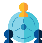
On-site access to HR