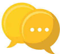
Staff engagement group

The college also has a range of measures to support staff wellbeing, such as: