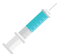
Free flu vaccinations