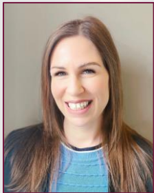
Regional Director (South Yorkshire Secondaries)