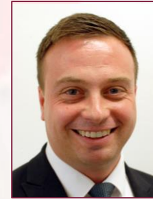
National Lead for Scholarship and Culture