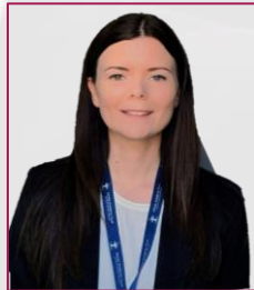
Deputy National Lead Maths