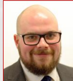
Trust VP (Cambs.)