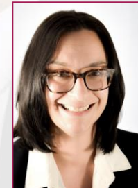
Trust A-VP (S. Yorks)