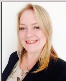
Head of SEND & Therapeutic Support