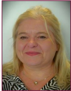
National Lead for English