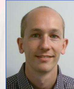
National Lead for SEND and AP