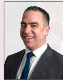
Trust VP (S. Yorks)