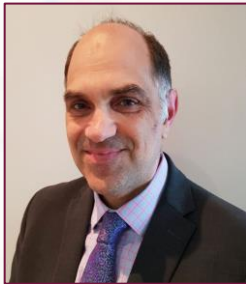
National Director of Secondary