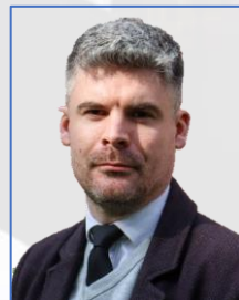
Trust VP (Cambs.)