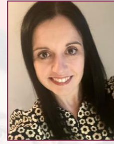
National Lead for Personal Development