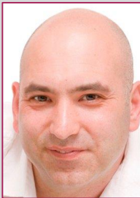
Regional Director (School Standards)

P4: Curriculum & Assessment P5: Curriculum Implementation