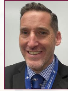
National Lead for Geography