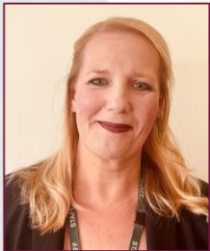
Regional Director (Cambridgeshire Secondaries)