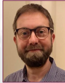
National Lead for History