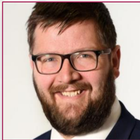
Director of Curriculum and Assessment

P1: Raising Y11 Achievement P3: Behaviour & Culture