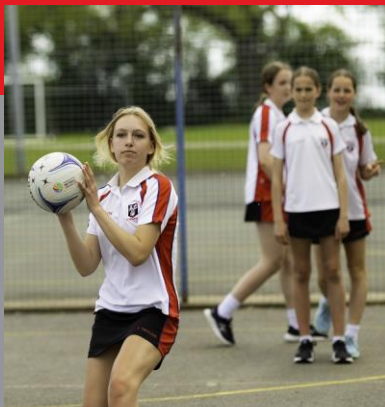
Annual Celebration of Sport Award