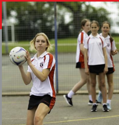
Annual Celebration of Sport Award