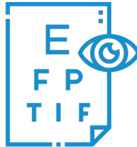
Free eye tests