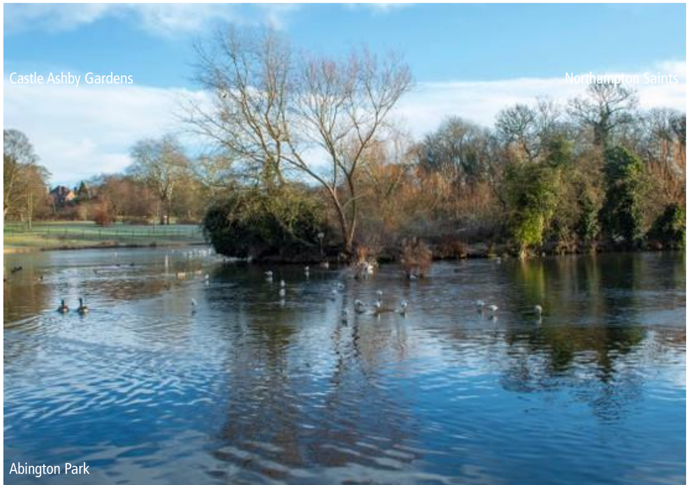
Castle Ashby Gardens