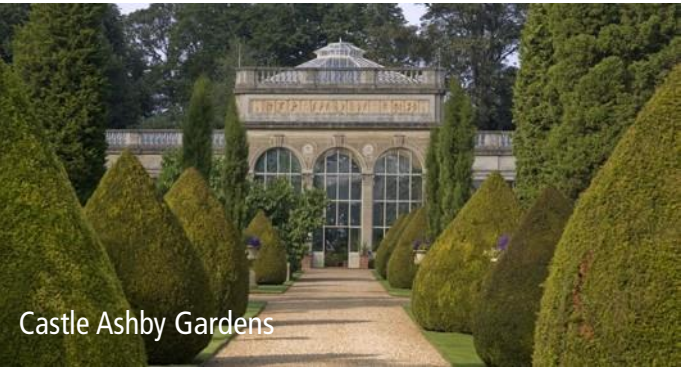
Castle Ashby Gardens