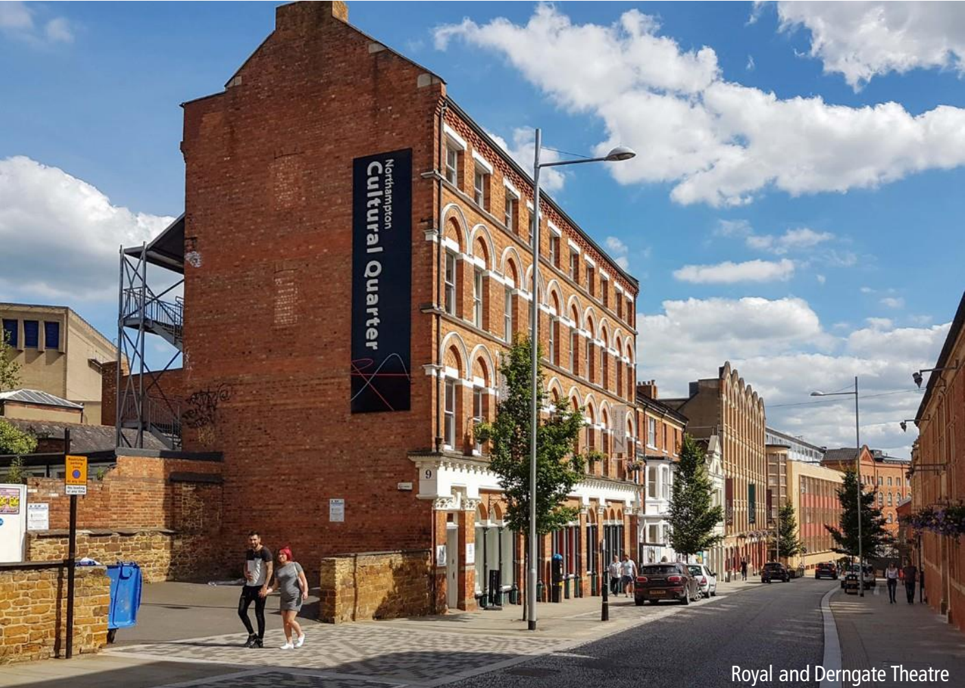
Royal and Derngate Theatre