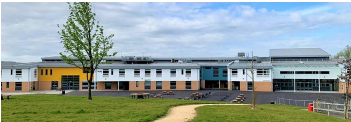
Sir John Thursby Community College, Eastern Avenue, Burnley, BB10 2AT, 01282 682313 www.sirjohnthursby.lancs.sch.uk

If you have any questions please do not hesitate to get in touch.