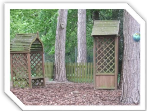
Outside play area