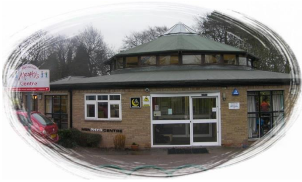
Wigston Menphys Nursery School

The Admin Assistant vacancy is for the Wigston Menphys Nursery in Wigston, pictured below.