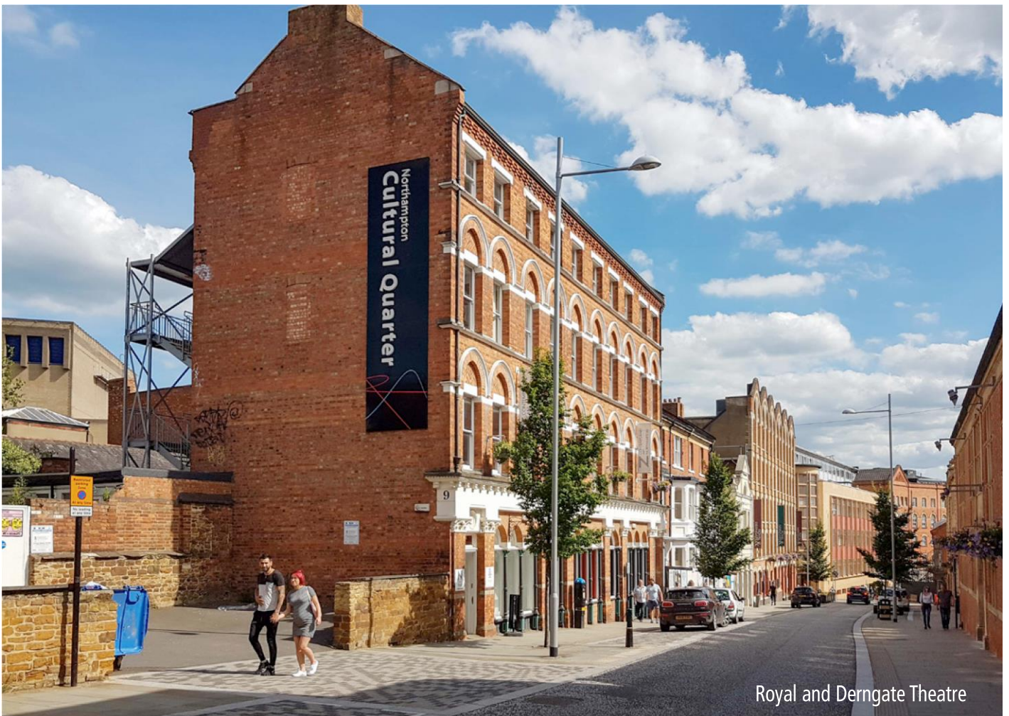
Royal and Derngate Theatre