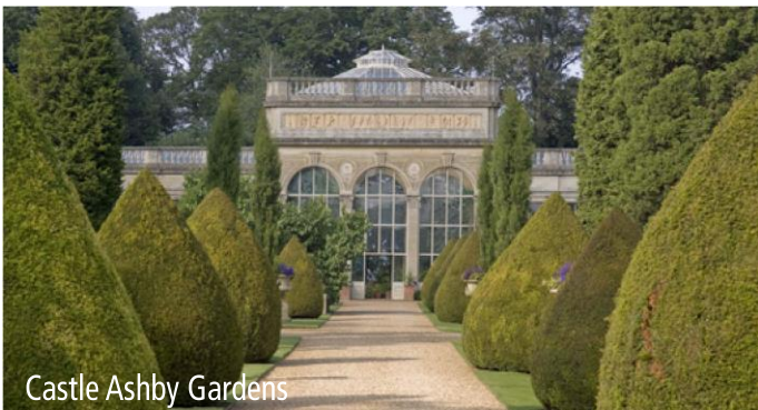
Castle Ashby Gardens