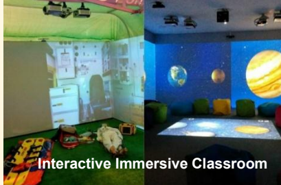
Interactive Immersive Classroom