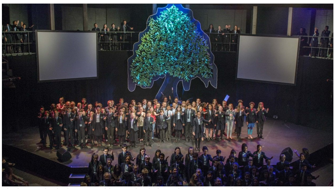
Glenthorne High School is a successful, over-subscribed, mixed comprehensive school for pupils between the ages of 11 and 19 situated in the London Borough of Sutton. In July 2017 we became part of the Willow Learning Trust with two local primary schools: Aragon and Abbey.

We believe in Achievement for All. We have a reputation for excellence and are well known for high standards of achievement and behaviour. Significant investment in facilities over the last few years has seen the building of two new science classrooms, a state-of-the-art Library and we are soon to add a new 6th form facility, due to be complete Summer 2023.