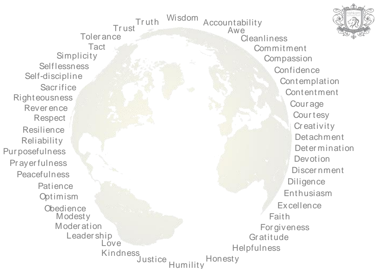
Nishkam Virtues Guide

We believe that to build strong communities and responsible citizens, our efforts must go beyond our current standard models of education and encompass a holistic approach. We believe that faith-based organisations have a significant role to play as part of the wider community; the heritage they draw upon illuminates some of the deeper quests for meaning and value in human life, going onto inspire a new vision and greater responsibility in our endeavours. We believe that our faith-inspired virtues define the character of education and that they should be intrinsic to a positive outlook on life. Virtues are awakened and strengthened in us when they are practised in front of us every day. At the School, we will all work to ensure both our educators and learners are instinctively exercising virtues in every thought, decision and action.