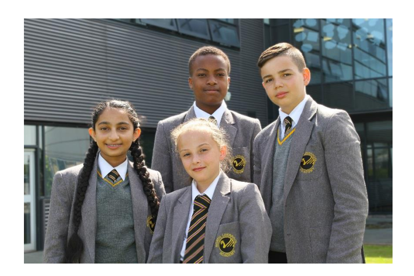
Welcome from the Principal Team

We live in exciting times — our great city of Liverpool is currently undergoing an amazing renaissance, with new jobs, investment and opportunities. We are proud to tell you that North Liverpool Academy is also undergoing its own renaissance. Our most recent Ofsted inspection has graded us as a 'good' school in all areas. Our exceptional academic results and reputation continue to confirm us as one or the fastest improving schools in Liverpool.