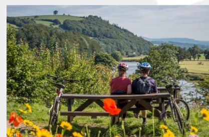
Crook O' Lune