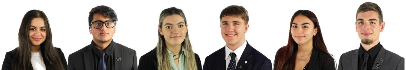
Our Head Prefect Team 2021-2022

Closing date: Thursday 19 May 2022 at 9.00 am