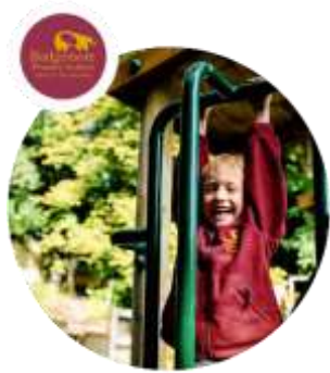
Badgemore Primary School

As a trust we are rooted in this approach and our ambition is clear; to improve the educational outcomes for children and young people. We don't want to change schools; we want to help them progress.