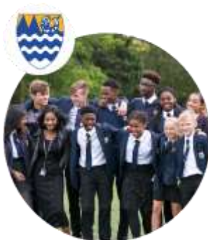
The Emmbrook School