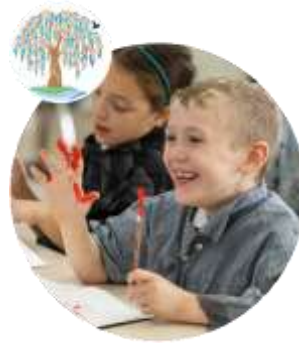
Emmbrook Junior School