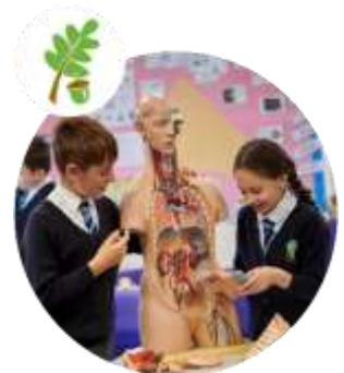
Westende Junior School