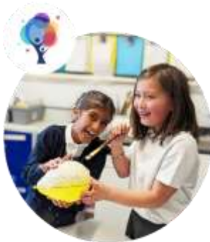
Nine Mile Ride Primary School