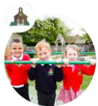
Shinfield Infant and Nursery School