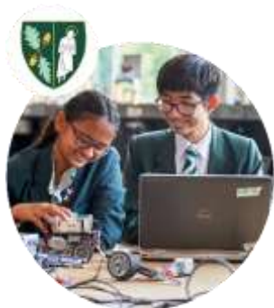
St Crispin's School