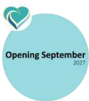
Hartland Primary School