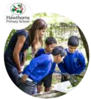
The Hawthorns Primary School