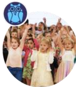
Owismoor Primary School