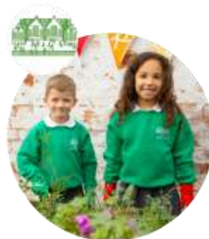
Wescott Infant School