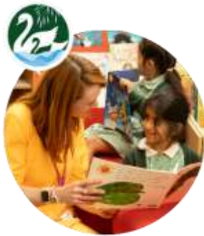
Emmbrook Infant School