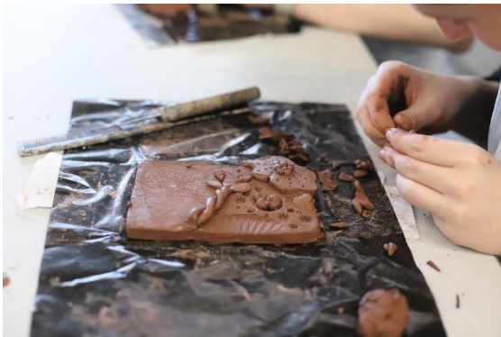
Food and DT.

There are currently 13 teachers in the department, three of which are part time. Whilst there are subject specialists in each area, many staff have a broad range of skills that they contribute to different disciplines. The versatility of staff is encouraged as this ensures sharing of good practice, and provides individuals with fresh challenges. There are three technicians who are assigned individually to: Art,