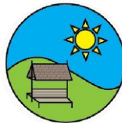
UFFCULME PRIMARY SCHOOL